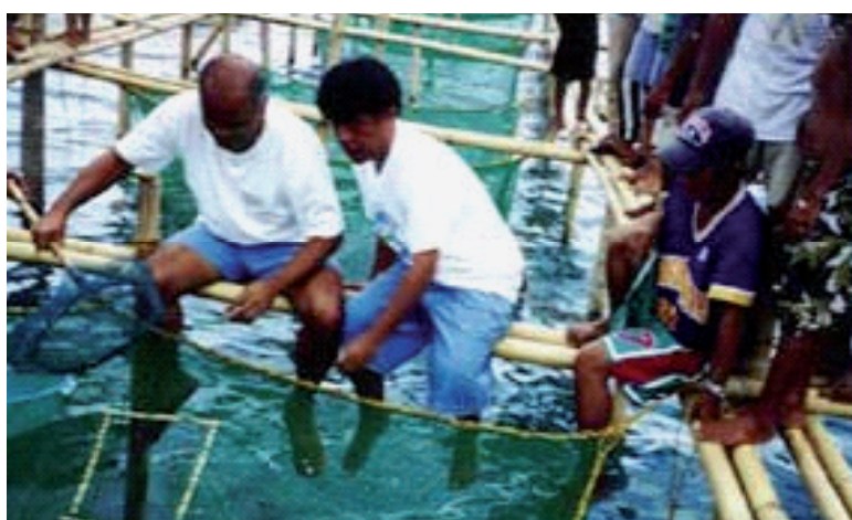
• Tubigon fisherfolk working hard for the Mariculture Project