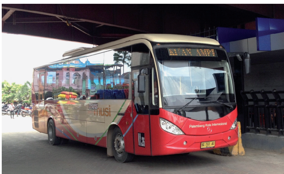
• Palembang Green Urban Transport Project

CDIA supported the City of Palembang to bridge the gap between the city's transport plan and actual investment in transport infrastructure projects. Activities included a comprehensive sector review and pre-feasibility study with focus on urban transport, infrastructure