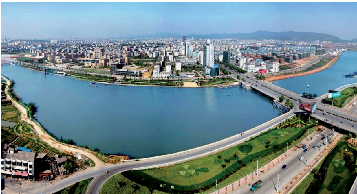
• The Xinyu Kongmu River Flood Control and Environmental Management Project

for up to 3 days in 2010 – the worst flood Xinyu had to face in the modern Chinese period, with the evidence that climate change is beginning to affect the city.