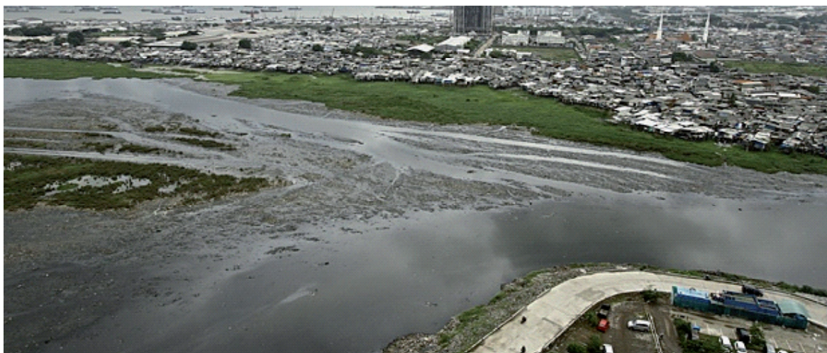
• Pluit Reservoir in danger of overflowing with heavy sediment

invited to talk and discuss with the Governor so that the communication could be active and a two-way process. Citizen engagement was a key component to the success of the project since a major challenge was relocating the people to the new legal subsidized housing.