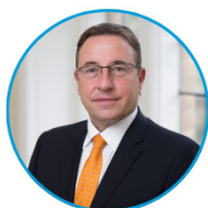
Mr. Achim Steiner Administrator, UN Development Programme