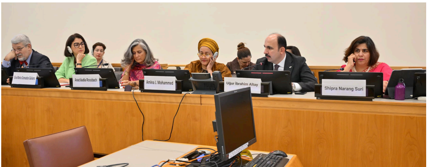
Speakers of the Local2030 side event at the Summit of the Future in New York, USA.

representatives can feed into UN statements, Committee of the Regions Opinions and Resolutions, EU Council Conclusions, and into briefings for the new EU leadership (Parliament and Commission), and was featured as one of the mechanisms contributing to the implementation of the High-Impact Initiative on SDG Localization.