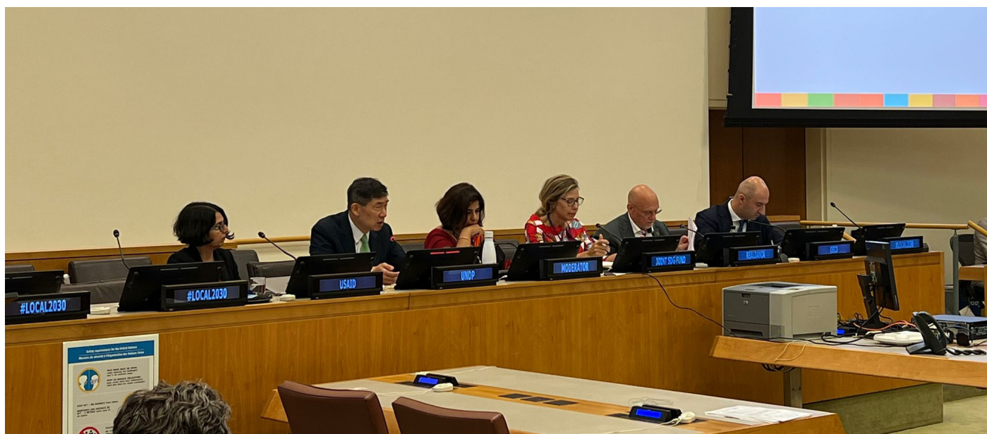
Speakers of the Local2030 side event at the High-level Political Forum in New York, USA.

wise, at the Summit of the Future, the Coalition emphasized the need to forge alliances for localizing the Pact for the Future, while at the 12th World Urban Forum (WUF12), it featured dedicated sessions on local financing, transformative policies, and partnerships. Moreover, at COP29, the Coalition launched its strategy towards COP30, focusing on adopting inclusive multi-stakeholder Nationally Determined Contributions (NDCs) while at the EU-UN Policy Dialogue on SDG Localization, the Coalition consolidated its partnership with the EU to advance SDG Localization and joint collaborations. In addition to these events, the Coalition is playing its role in other relevant fora such as the 7th OECD Roundtable on Cities and Regions for the SDGs, the EU-UN Dialogues on SDG Localization, the 2024 International Mayors Forum, the Deusto University Forum on the SDGs, the 4th International Conference on Small Island Developing States, and the UN Climate Change Conference (COP29), highlighting its leadership in multi-level governance and multi-stakeholder approaches for inclusive decision-making.