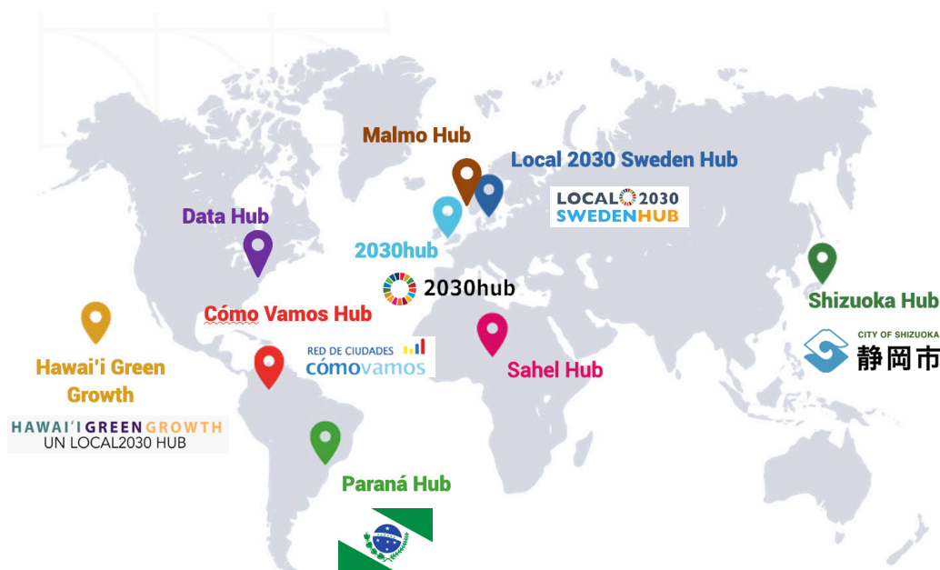
World map showing Local2030 Hubs.

neurship and advocacy during Global Goals Week, while integrating SDG priorities into the city's Net Zero Living Plan and earned national recognition for its visitor economy efforts. The Paraná Hub supported SDG municipalization in 399 municipalities through the BI ODS platform, established an ESG Committee, and strengthened Lusophone cooperation at the World Urban Forum. The Shizuoka Hub promoted youth engagement and sustainable industries, raising SDG awareness through international school collaborations with Taiwan, Vietnam, and Australia. The Sweden Hub focused on inclusive urban development, organizing an Intergenerational Town Hall to amplify youth perspectives ahead of the Summit of the Future.