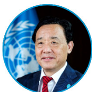
Qu Dongyu Director-General, Food and Agriculture Organization of the UN