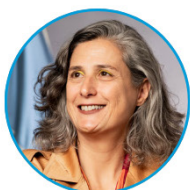
Anacláudia Rossbach Executive Director, UN Human Settlements Programme; Under-Secretary-General, UN

The Steering Committee, co-chaired by UN-Habitat and FAO, made critical decisions to advance SDG localization during their meetings held in Nairobi and New York.