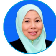
Noraini Roslan President of the Municipal Council of Klang, Malaysia