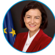
Eva María Granados Galiano Secretary of State for International Cooperation, Ministry of Foreign Affairs, European Union and Cooperation, Spain