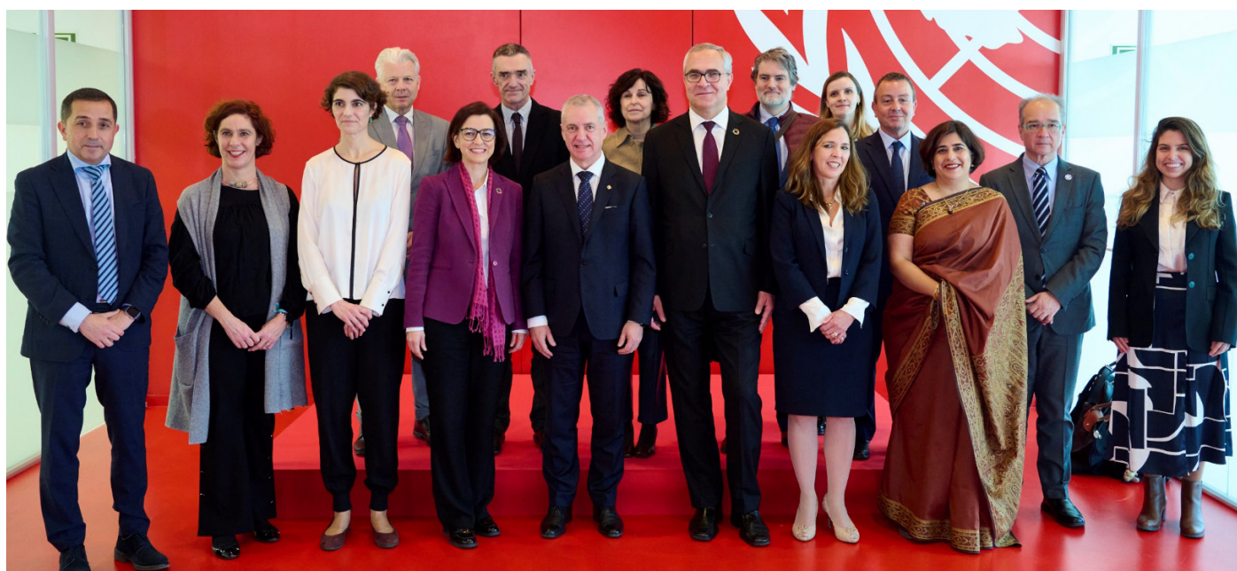
UN Directors Group Retreat welcome with the hosts of the Local2030 Coalition Secretariat in Bilbao, Spain.

At the global level, the advocacy process promoted by the Local2030 Coalition pools together expertise from across the UN System to secure a whole-of-UN perspective and position on localizing. At the local level, it supports the Coalition's constituencies in identifying and promoting concrete solutions that exemplify this localization and its impact. The Coalition brings together UN participating entities on one hand with representatives from its different constituencies on the other hand, ensuring the convergence of global and local processes, with the former more focused on advocacy and UN technical expertise and convening power, and the latter showcasing concrete solutions in action.