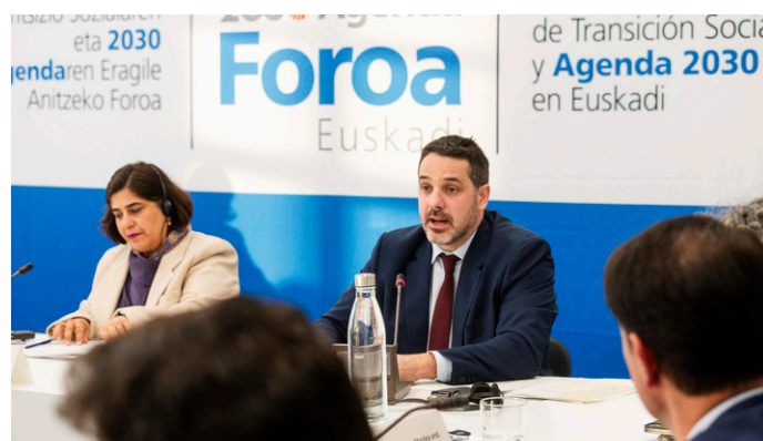
Participants of the 2030 Agenda Euskadi Forum.

Finally, the Local2030 Coalition is monitoring how SDG Localization is reflected within key UN processes and outcome documents. Throughout 2024, SDG localization, thanks to the efforts of the Local2030 Coalition, its member UN agencies and partner constituencies, has been referenced as being essential to accelerating the implementation of the SDGs in key political outcome documents including the 2024 HLPF Ministerial Declaration, the UN Pact for the Future, and the Cairo Call to Action at WUF12, all emphasizing the importance of local actors in accelerating SDG implementation.