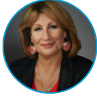
Emilia Sáiz Secretary-General, United Cities and Local Governments on behalf of the Global Task Force of Local and Regional Governments