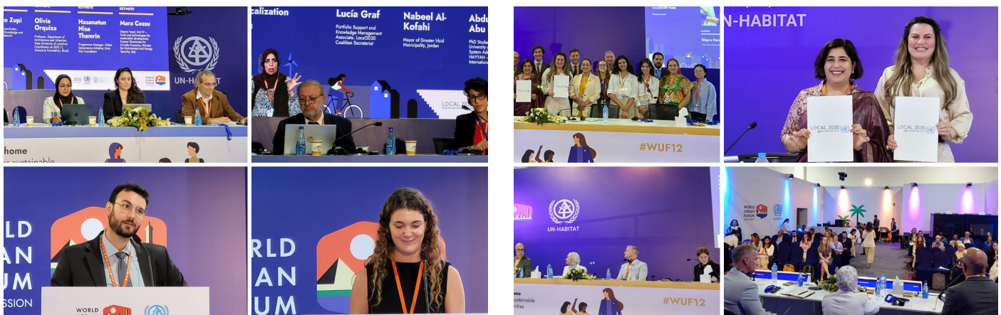
Local2030 Knowledge and Scientific Network and Local2030 Hubs side events at the 12th World Urban Forum in Cairo, Egypt.